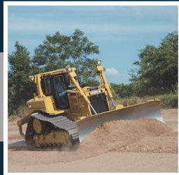
Transmission Gully Project